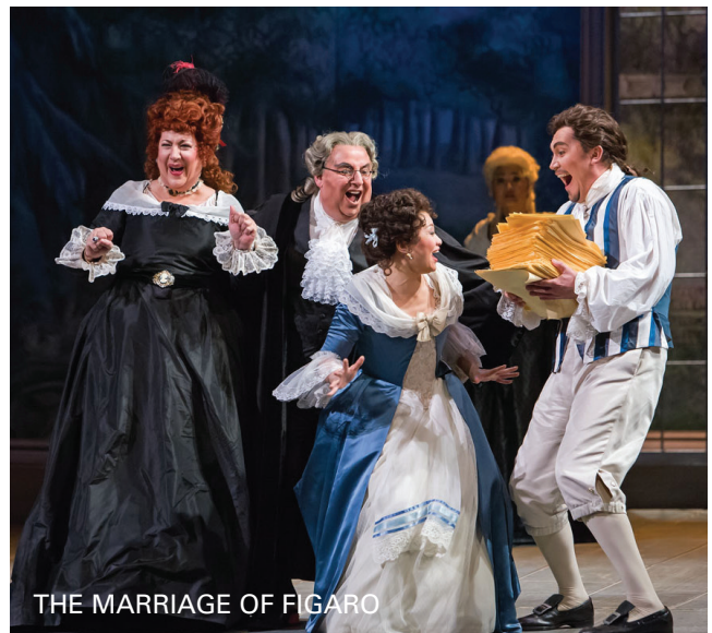
THE MARRIAGE OF FIGARO

Course: AmericanParisFW17 – Detroit Opera House