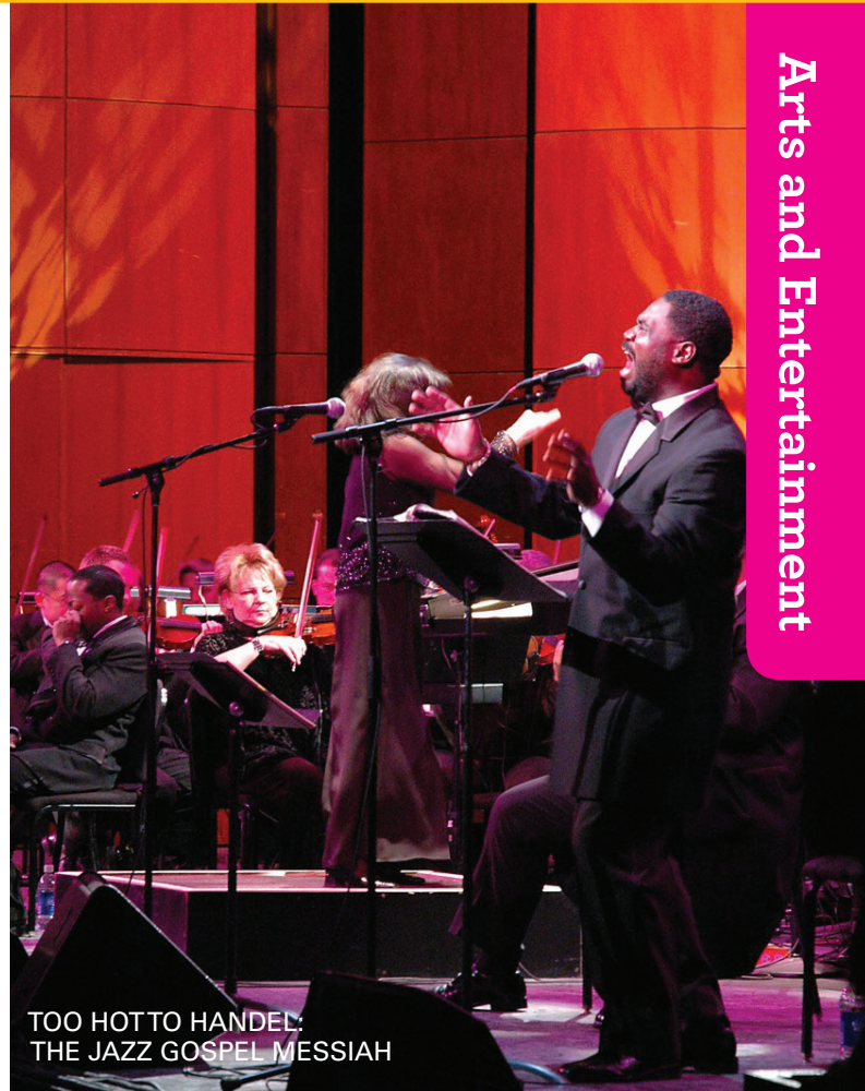
TOO HOTTO HANDEL: THE JAZZ GOSPEL MESSIAH